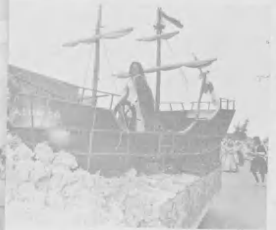
Noord District Queen The Discovery of Aruba